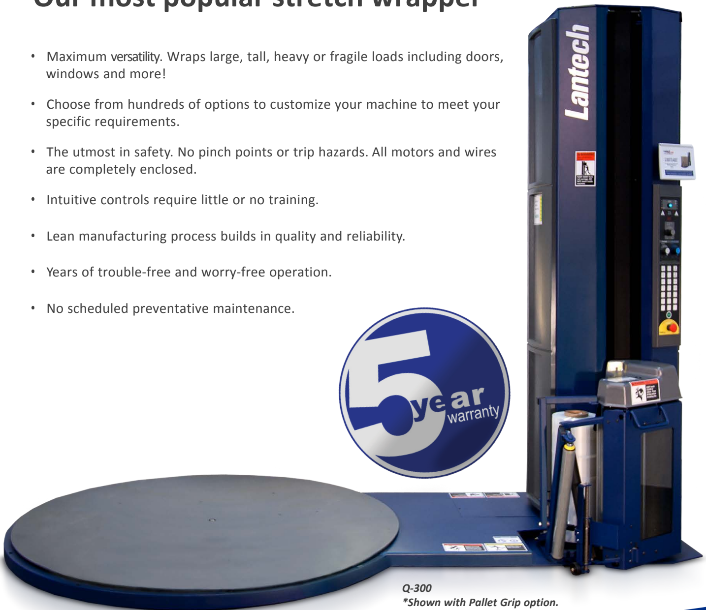
Q-300 *Shown with Pallet Grip option.